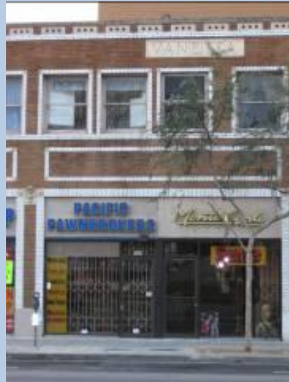
The long-time Goldfaden store location today second from left at 7402 Santa Monica, Los Angeles