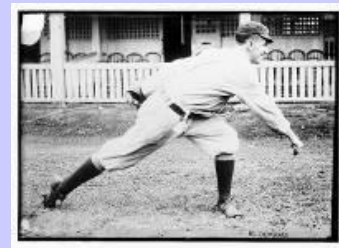
Al Demaree in Spring Training