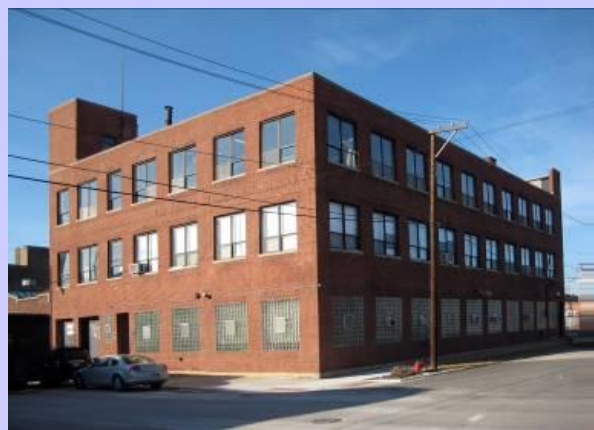
1732 W. Hubbard – original home of Dietz Gum and the R-304s