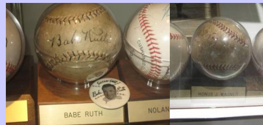
Babe Ruth and Honus Wagner autographed balls